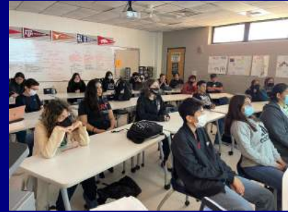
Presenters take time from their busy day to share vital, career information with students via Zoom.